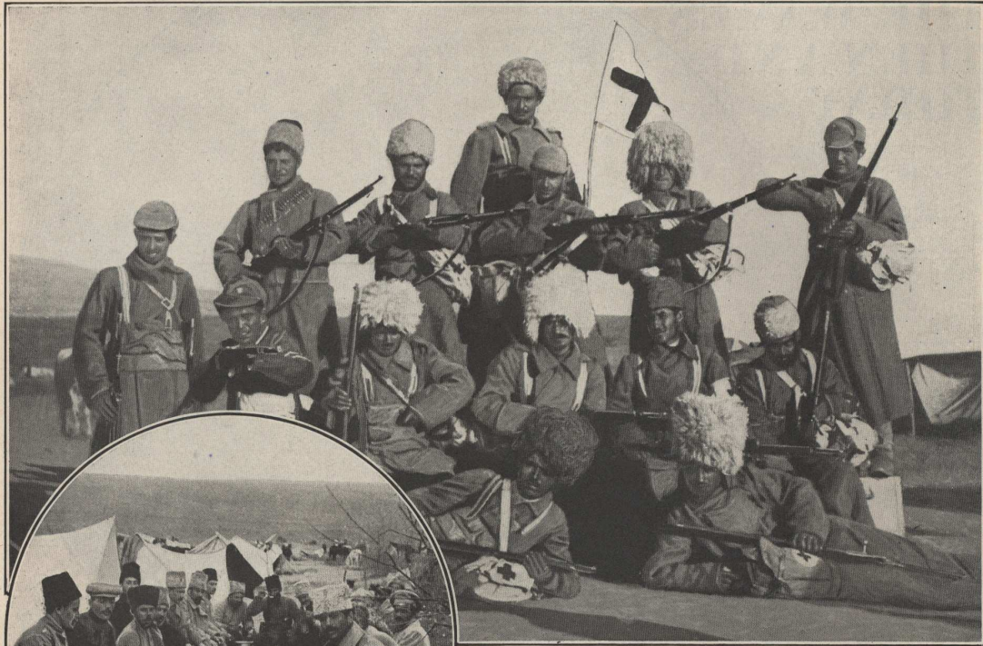
MEN OF THE ARMENIAN RED CROSS